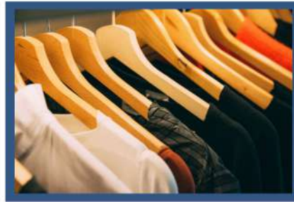
Self-consciousness of Personal Attire