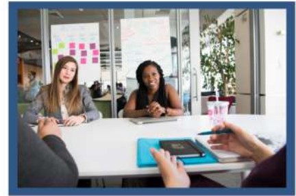
Access to Resources